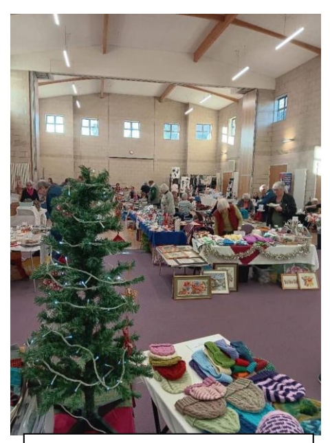
Christmas Fayre 2023

It has become our regular pattern to hold two Fayres during the year, these were in November 2023 & May 2024. The Christmas Fayre was a really busy event but the Spring Fayre was less well attended this year, so the church council are seriously considering changing the pattern or thinking of different fundraising activities. These Fayres generate much needed funding for the Church, but as we need lots of volunteers to run them we need to be sure that their time is well spent.